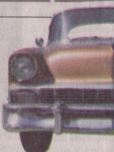
22 CAR SHOW